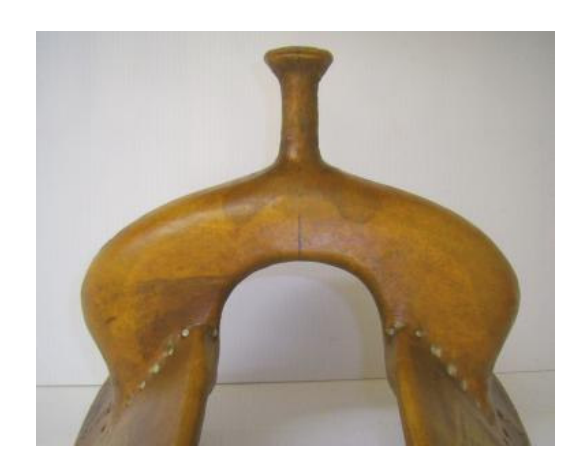
12" Louellen fork