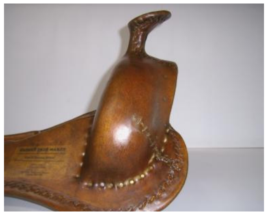
Chuck Sheppard fork, 3 3/4" stock

We have also seen this fork style spelled as a Chuck Shepard and Chuck Shepherd, though we believe the original name was spelled Sheppard. We have made Chuck Sheppards from 11" to 13\frac{1}{2} " wide, but due to amount of top slope it has, it is best at narrower widths. 12" is the most common order we get for width.