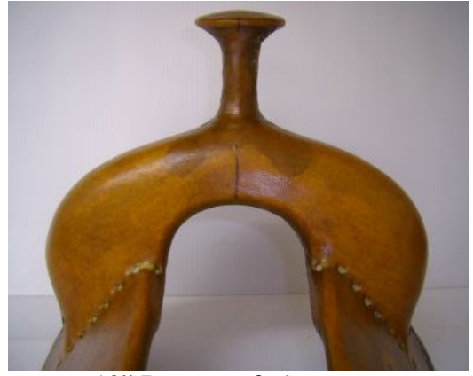
12" Bowman fork