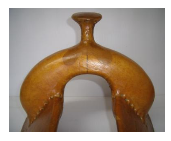
12 1/2" Chuck Sheppard fork