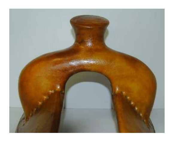
12 1/2" wood post High Country fork