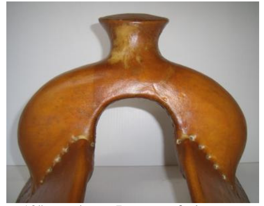
12" wood post Bowman fork