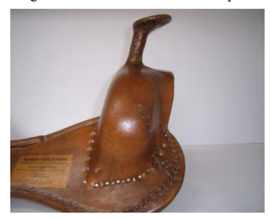
Bowman fork 3 3/4" stock

With a very rounded shape due to a moderate slope to the top and minimal and low undercut, this is a fork shape that works well at a smaller width. 12" is most common, but for people who want a lighter weight saddle an 11" Bowman often is chosen. Most are leaned ahead, though we have made a few stood up Bowman forks.