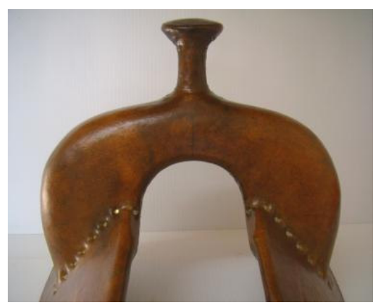
12" Buster Welch fork