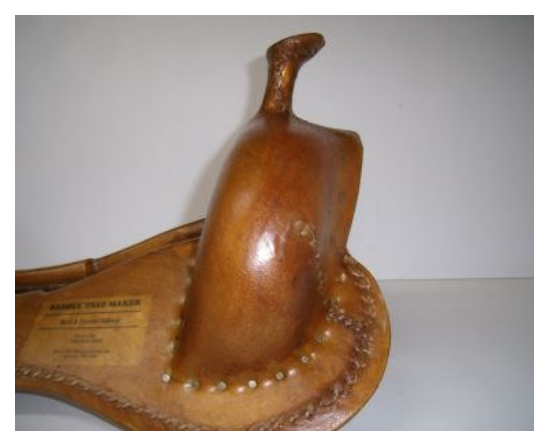
Buster Welch fork, leaned ahead 3 3/4" stock

The original Buster Welch was a stood up fork, though we have also leaned it ahead when asked. It is rounded all the way down to the bars with no undercut on the side. 13" is the most common width, though we have made 12" and 12\frac{1}{2} " also.