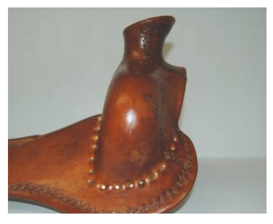
Wood Post High Country fork, stood up 4 1/4" stock