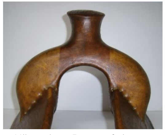
11" wood post Bowman fork