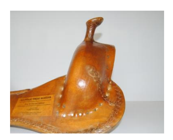
Dee Picket fork, 3 3/4" stock

This is another fork style with lots of top slope, slightly more than a Chuck Sheppard, but the undercut comes up the sides more than on a Chuck Sheppard.