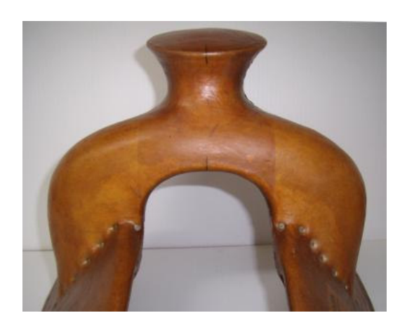
11" wood post High Country fork