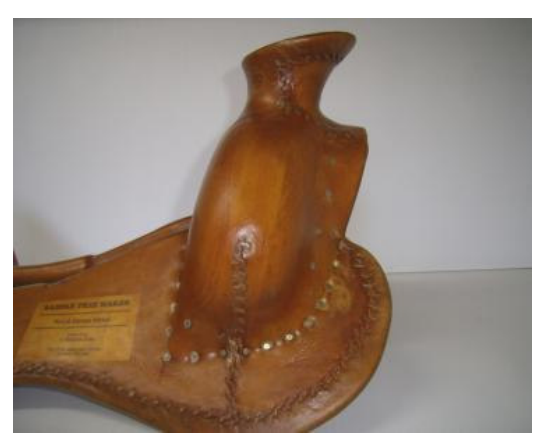
Wood Post Bowman fork 4 1/4" stock