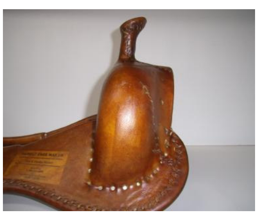
Buster Welch fork, stood up 4" stock