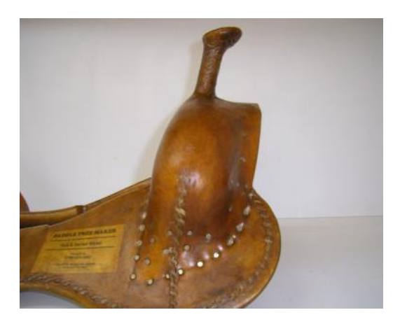
Louellen fork, 3 3/4" stock

We have also seen this name spelled Lieuallen, Lieullen, and Lieuellen, but we use the Louellen spelling for simplicity's sake. This fork has the same style of undercut on the sides as the Modified Association, but it has more top slope to it. The most common width we build is 12", though 13" is not uncommon and we have made them as wide as 14".