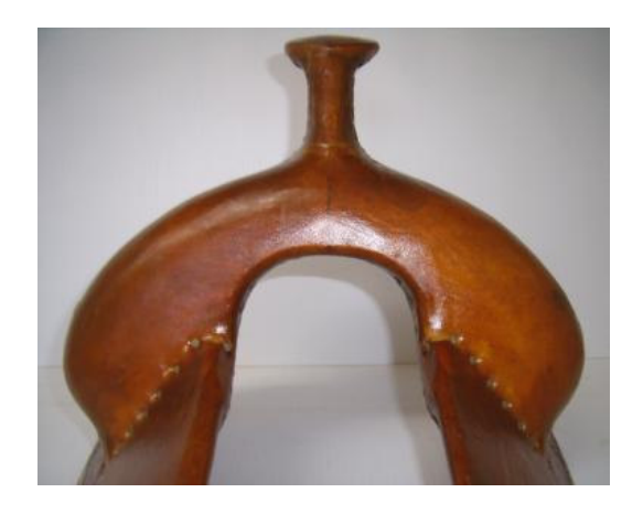
13" Chuck Sheppard fork