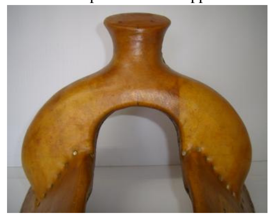
12" wood post Chuck Sheppard fork