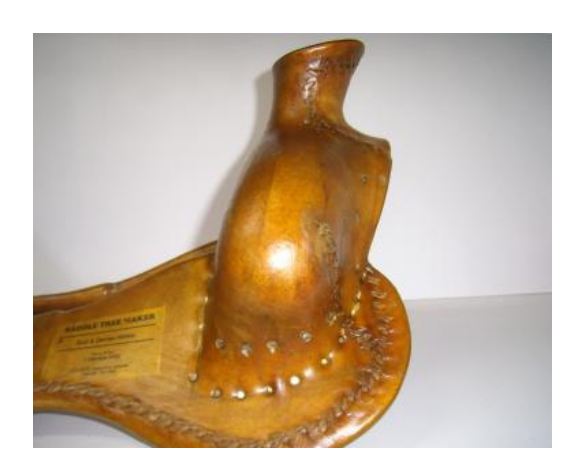
Wood Post Louellen fork, 4 1/4" stock