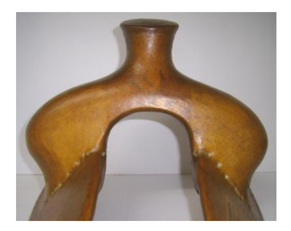
13" wood post Louellen fork