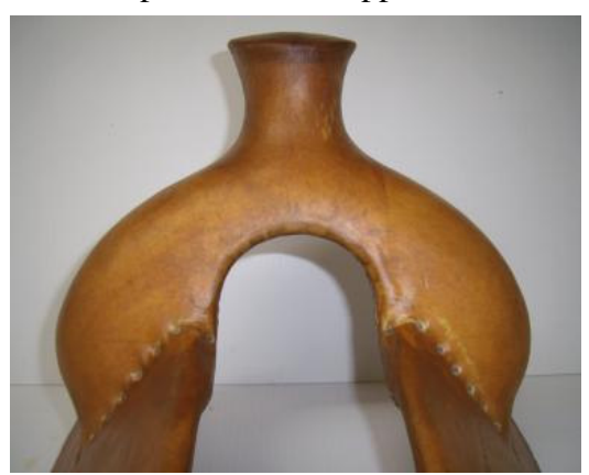
11" wood post Chuck Sheppard fork