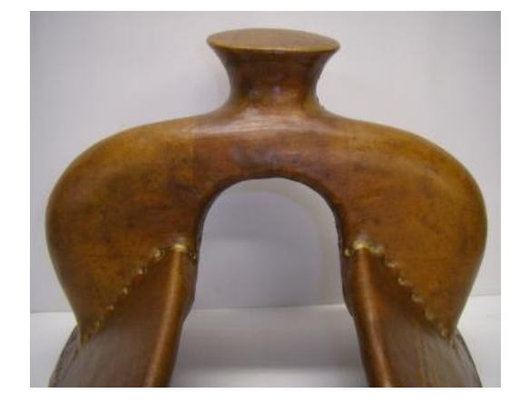
13" wood post High Country fork