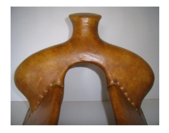
14" wood post Louellen fork