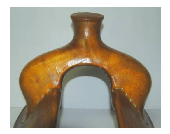
12" wood post Louellen fork