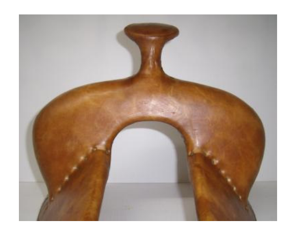
13" High Country fork