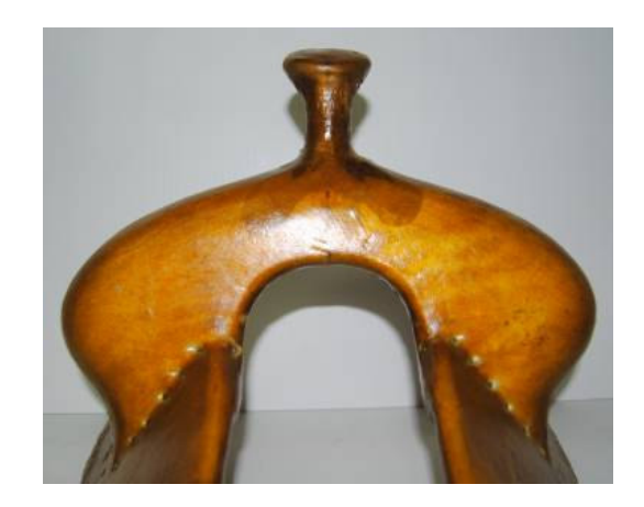
13" Louellen fork