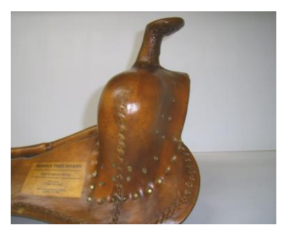
Arizona Roper 3 3/4" stock plus backsweep

The back sweep added to this fork with minimal top slope and a straight undercut to the sides makes this a distinctive style fork.