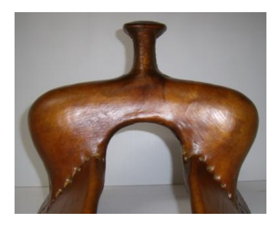
12" Arizona Roper