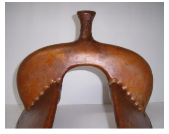
13" Buster Welch fork