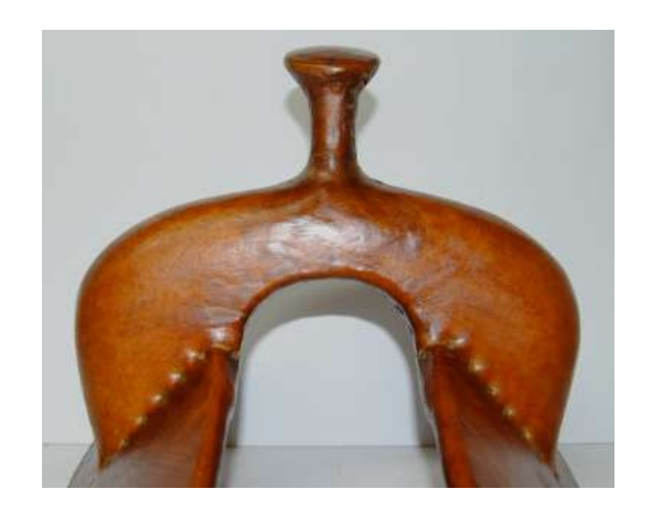
12" High Country fork