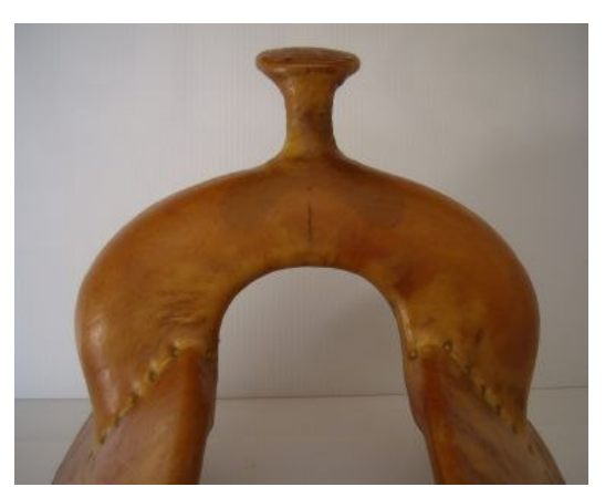
11" Bowman fork