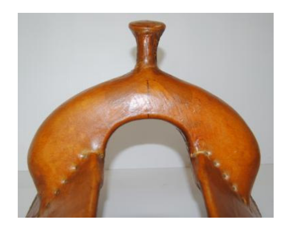
12" Dee Picket fork