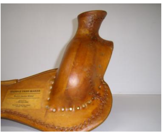
Wood post Chuck Sheppard, 4 1/4" stock