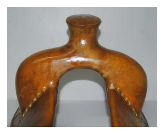
12" wood post High Country fork