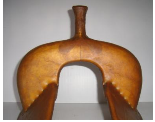
12 1/2" Buster Welch fork