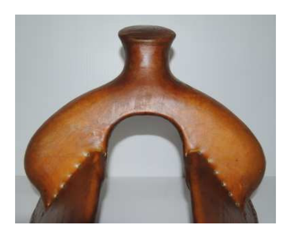
13" wood post Chuck Sheppard fork